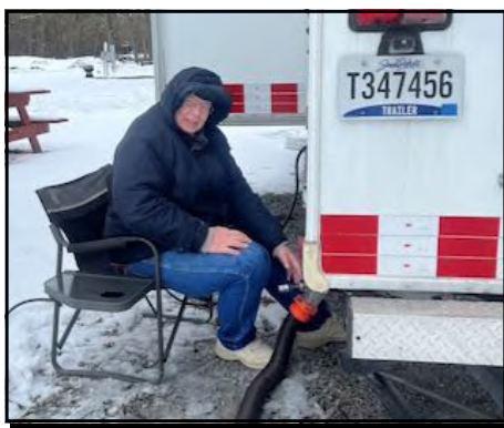
Furlough winter camping 2025. Emptying black and gray water tanks.

There are so many different kinds of RVs and no such thing as the perfect RV. You want to get one that checks as many of your boxes as possible. How much will it be used and in what kind of weather? Your tow