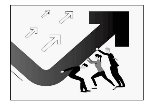
Praising God For You

A. Covid seems to have affected everyone in some way. One way it affected us was it cut our USA furlough speaking in half, as churches closed. We also saw a decline in income caused by the pandemic, which was certainly understandable.