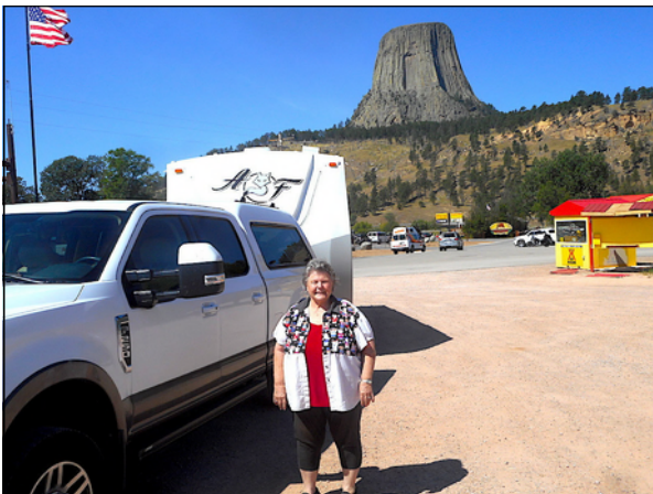
Another beautiful sighting! What state are we in?