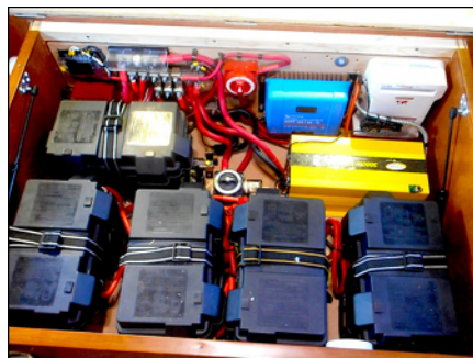
Installing batteries, chargers, solar controller, & inverter UNDER OUR BED