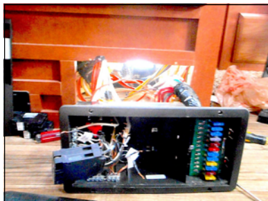
Re-wiring the electrical