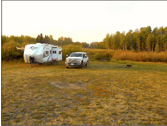
Boondocking means no hookups, but its free!