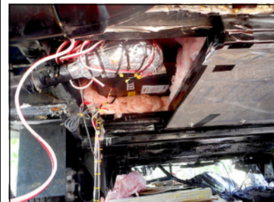
Under the trailer, heaters and insulation