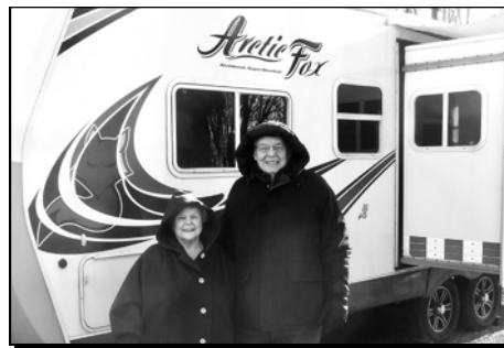
Furlough camping in cold weather.

A. Our hope, for our ministry in Africa, is to continue as long as the Lord provides us with adequate health. We plan to return in June of 2020, after visiting our churches in America. I have felt that you retire from a job. But Joy in the Harvest is so much more than a job to us. What