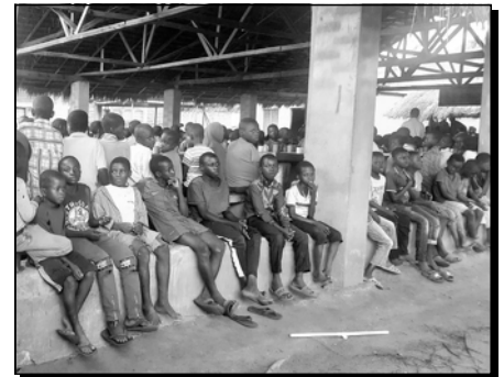
For some children, this is the only food they get to eat.

We usually see an increase in numbers in December. But this year there are more kids than ever before. We make sure each one is fed — body and soul. Each gets a large meal and we provide Bible stories (with flannel graph), songs, and prayers. THANK YOU for making it possible!