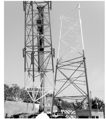
The Chinese road crew crane put up the sections from 20 feet to 60 feet.