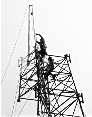
Each section above 60 feet had to be hoisted into place by hand.