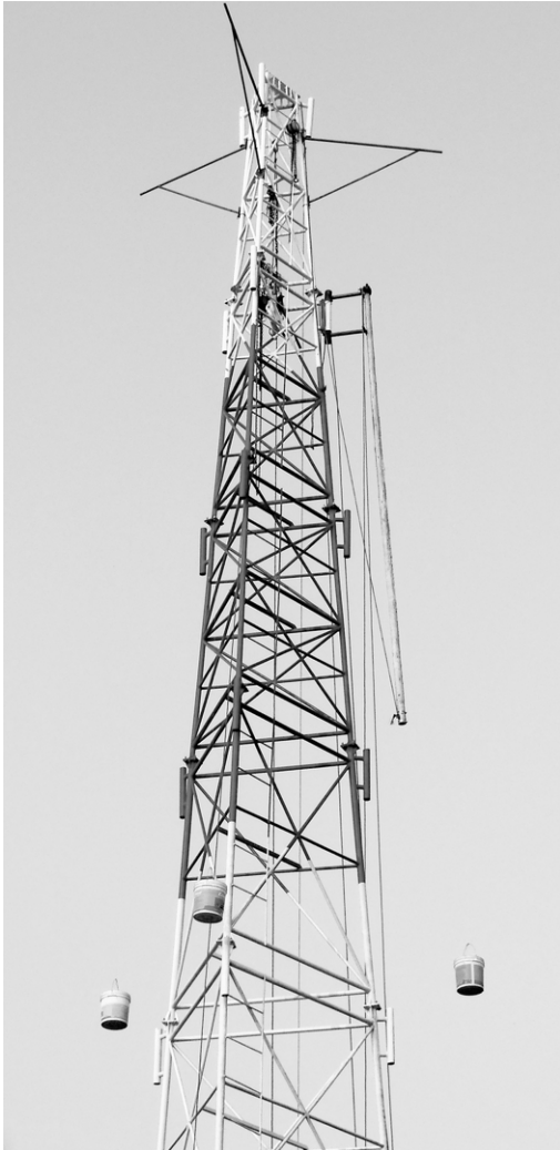
Buckets of sand became our improvised alignment tool to get it straight.