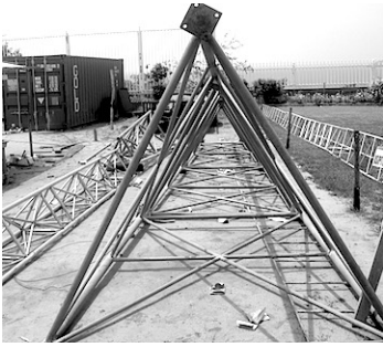
Constructing the tower in our yard.