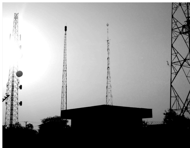
Our tower with its top orb (middle of picture), nestled among its neighbors, on the highest spot in Kigoma.