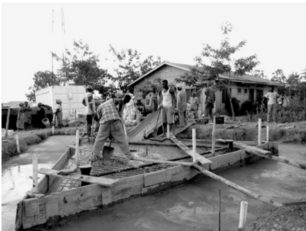
Step 5. Pour a thick layer of concrete in the surrounding area and an extra thick layer around the metal base.