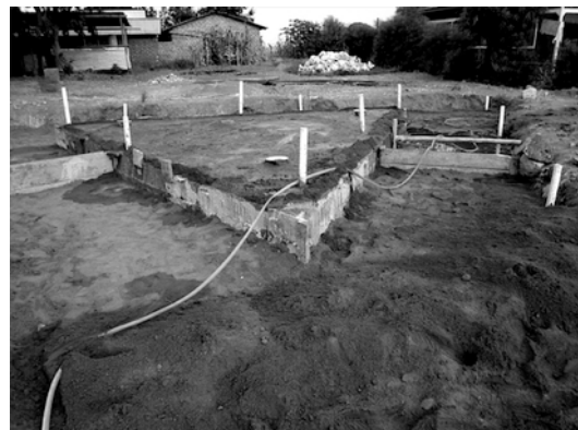
Step 6. Cover it all with sand and keep it wet for 3 weeks. White pipes go down below concrete levels so salt water can be added later to increase ground conductivity.