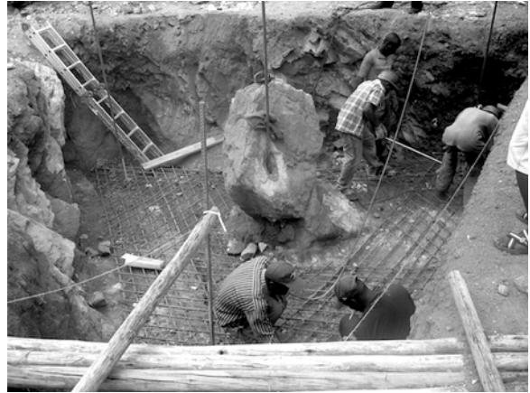
Step 2. Drill four 6 inch holes down 50 feet, fill them with rebar and concrete, dig a large 7 foot deep hole, line the bottom with rebar and pour a two foot thick layer of concrete in the bottom.