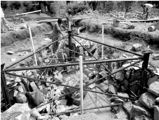
Step 3. Weld the metal base to the 50 foot deep rebar and bottom rebar grid, and encase the metal base in a 5 foot layer of cemented rocks.