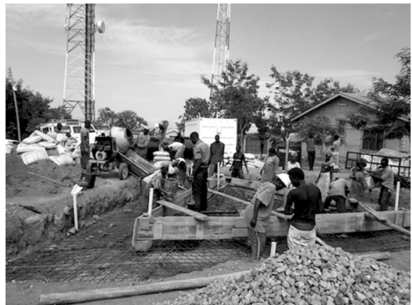
Step 4. Make another grid of rebar at the surface, make forms so the concrete is extra thick in the immediate area of the metal base.