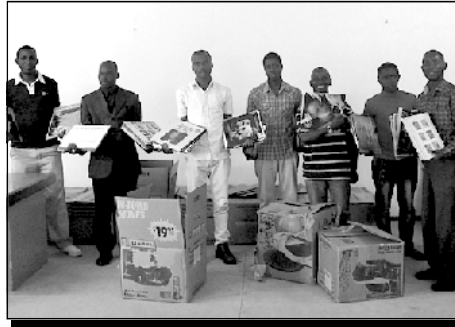
Africans love all kinds of music. It is a huge part of their culture.

Over one ton of donated LP records, sent by ocean freight from Illinois, have arrived safely in Kigoma. THANK YOU to all who donated music on LPs and CDs! We so appreciate these donations! Your music will be heard on the airwaves soon!