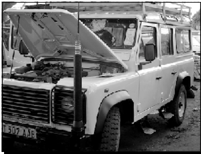
Stretching mission dollars, the old Land Rover is ready for more work.

After 12 years of faithful service, our Land Rover seemed to be on its last legs. The engine was a money pit and the whole vehicle was in bad shape. When an engine from a wrecked Land Rover became available, we were able to buy it, install it, and do body and interior work. It is now ready for more years of work.