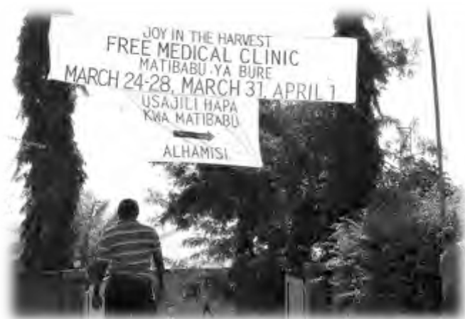
While over 4,000 poor people sought care - we were able to treat over 1,400.