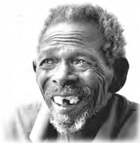
Jesus loves me, this I know.