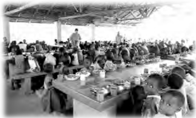
Hungry children find food at Joy in the Harvest.