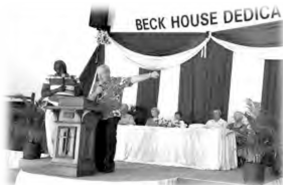
A story about Glen Beck's watch at the Beck House Dedication.