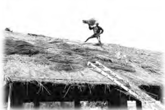
Feeding Center grass roof needed replacing.