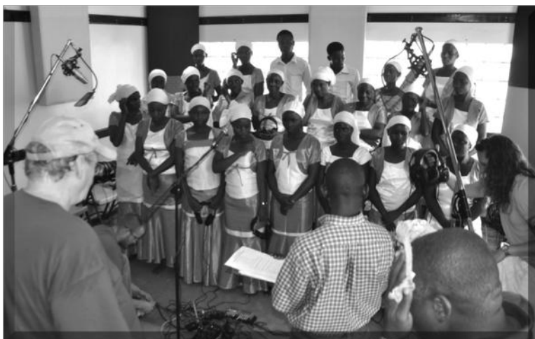
Seventeen choirs sang unto the Lord