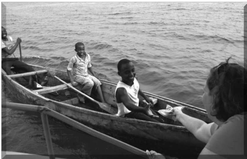
Lot's of smiles when the fishing kits are given out