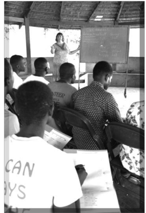
Students are eager to lean English