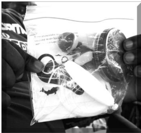
Inside a fishing kit: hooks, line, bobbars, sinkers, and a tract called "Jesus Loves Fishermen"