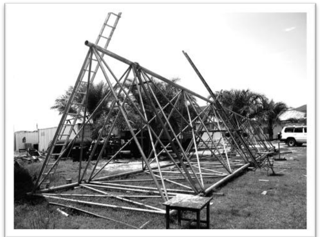
The main broadcast tower for the mountain top is under construction. It is a big project.