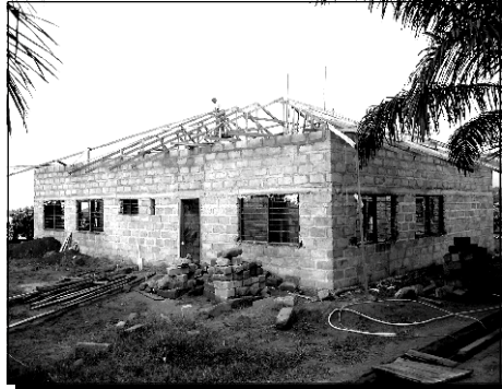
The new Beck Guest House with a beautiful view of Lake Tanganyika.

The walls are up and the roof trusses are going on. The drain plumbing is done and connected to the septic system. Once the building is under roof, we will pour the floors and start with plaster and stucco.