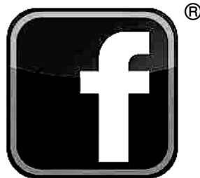
“Facebook”, my new frontier?

Immediately my email inbox was filled with dozens of requests and