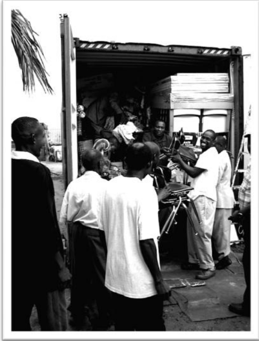
Suddenly we knew, everything was okay in the container.