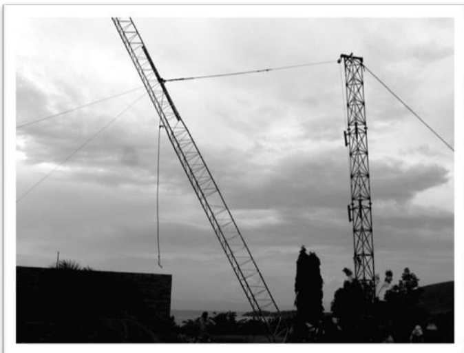
We built a 40 foot tower to be able to hoist our studio link tower. This was the first trial run at raising the studio link tower.