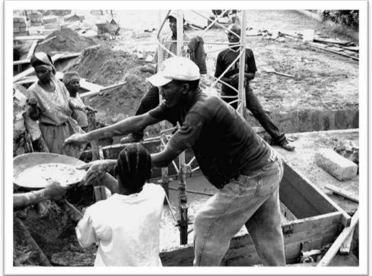
Pouring the foundation for the studio link tower. It took 40 bags of cement.