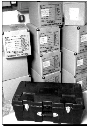
School kits waiting in Bath, PA

A. We are so excited that churches and individuals are collecting things for Africa. Our last newsletter (Sept ‘12) yellow page is our “needs list”. It is also on our website. Feel free to contact us for more information about donations.