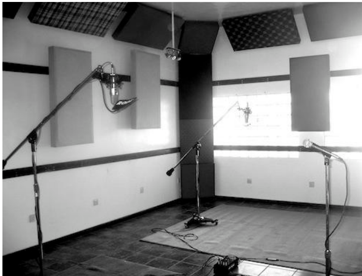
The "Live Room" where performances of choirs, interviews, etc., will take place.