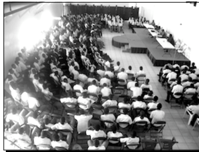
Capacity crowds. Life saving information.

Every year we sponsor a soccer tournament. Each player must get a lecture on HIV / AIDS before being allowed to play. This year secondary schools were invited to send teams. In the past it was semi-pro teams that played. We filled the Community Center twice with students receiving the lecture. Lives are being saved.