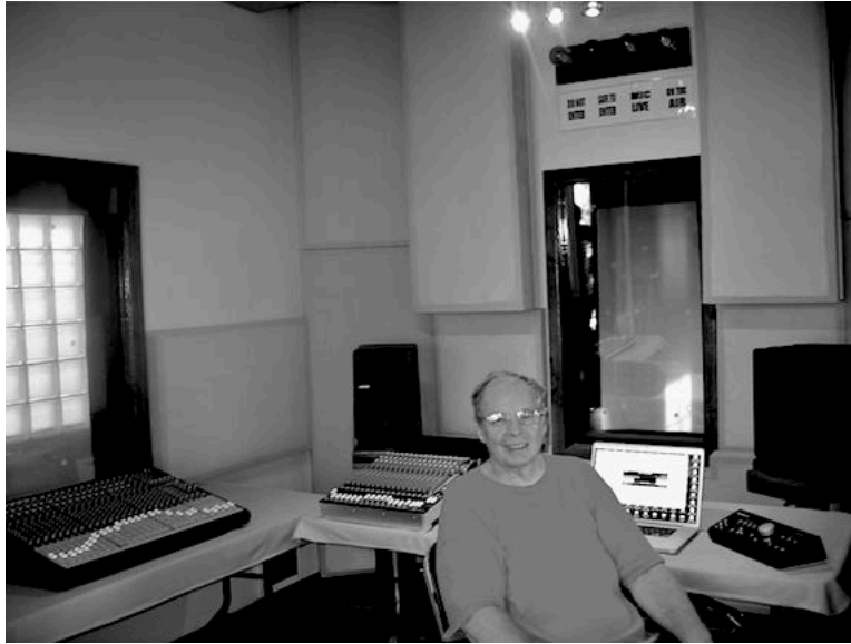
The new Joy in the Harvest Recording Studio Control Room.