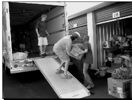
The Youth Group from Fishers UMC loading donations into a U-Haul truck in Carmel, IN for transport to the ocean shipping container in Lynwood, IL

A. Lord willing, YES! We plan to begin construction of the Beck Guest House as soon as our next term begins. We will need to ship supplies for that project. At the beginning of furlough we plan to send out, to our mailing list, our "needs list" of items we would