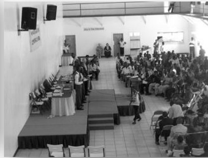
JOY Computer School Graduation Ceremony.