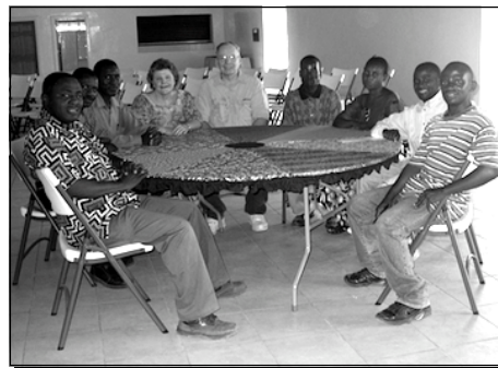
The JOY team in charge of the Community Center — calendar, rules, cleaning, security, & volume control.

A. The building is so new, it is impossible to give a complete list. Church seminars are on the list. So are youth meetings, children's ministries, classes from "how to plant a tree" to college courses, and missionary Bible studies. Wedding receptions and "send offs" for those marrying in distant