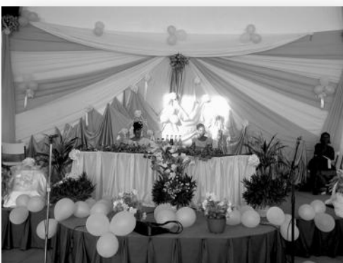
A "Send Off" wedding party for the marriage of Furaha, a girl from our church.