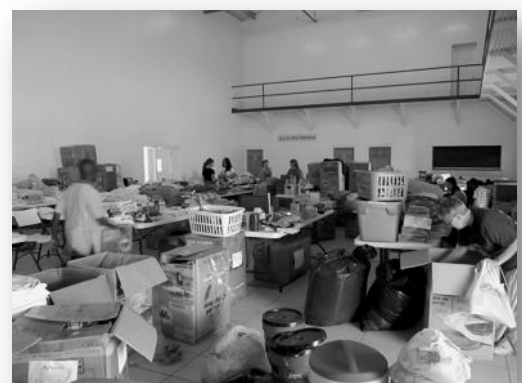
Our Muncie Indiana team did a fantastic job of sorting and organizing donated supplies. What a job! But what a blessing!