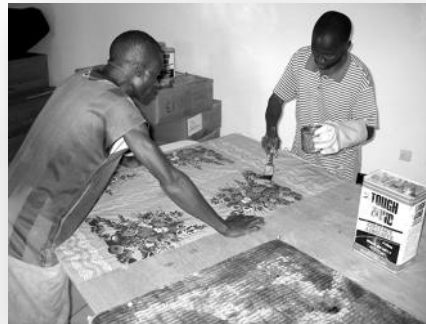
Making acoustical absorber panels for the new recording studio.