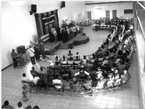
Hope of the Nations Bible College held their graduation ceremony in the Community Center.