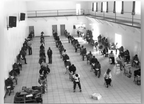
Final Examination for the JOY Computer School .