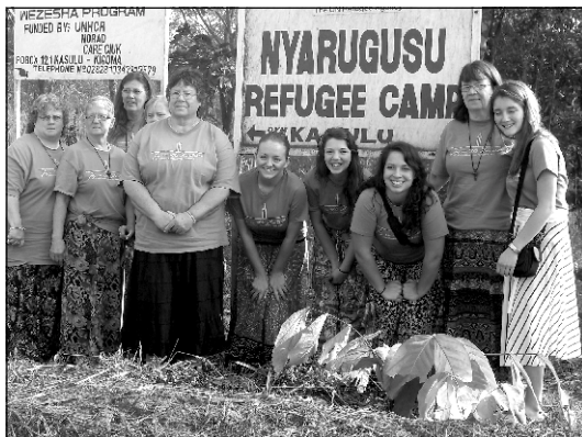
Ten ladies from the High Street UMC in Muncie, Indiana visiting the refugee camp.

When Air Tanzania went bankrupt, the team was flown in by small aircraft. Three on the team had never flown in an airplane before! They got to see the chimps and other African