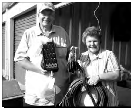
Microphone cables going into boxes for the Batesville IN UMC mission team to bring in January.

We usually ship an ocean freight container (about a truckload) of