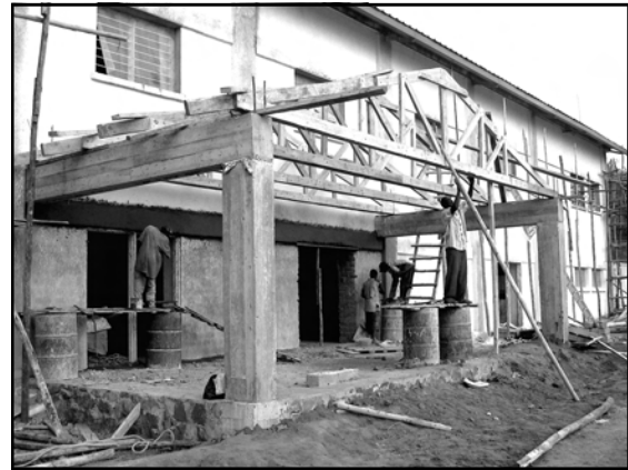
All four rafters in place. Also note mosquito wire is being installed over the windows.