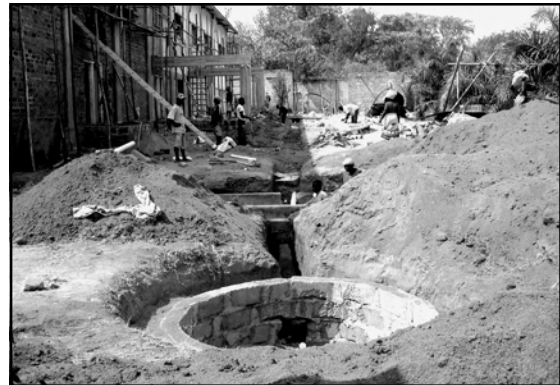
A septic system had to be constructed. The sewer line was over 160 feet long.