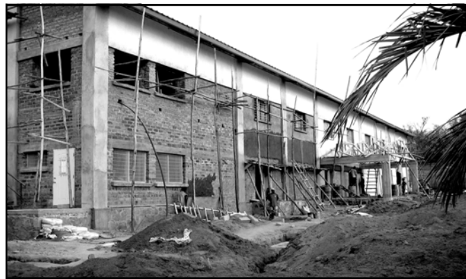
The front of the building is being plastered with stucco. The dirt mounds are from the septic system work. The inside of the building is now completely plastered.