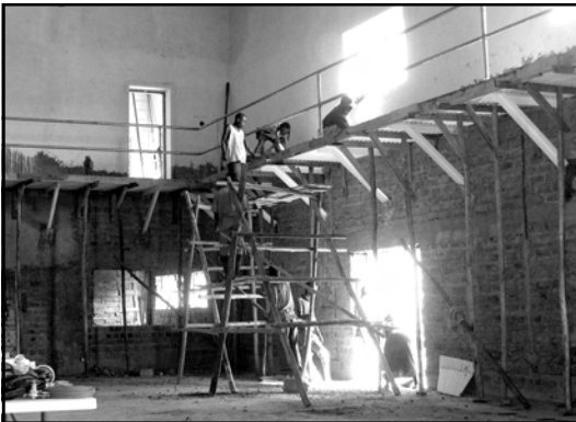
A "catwalk" was built 12 feet high along two of the inside walls to allow for photographers and lighting.