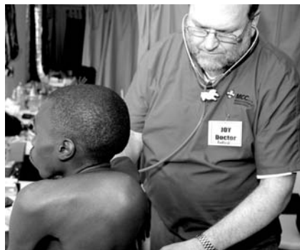
The medical team of eight volunteers provided care for the ill and saved lives while being a living testimony of the love of Jesus Christ.