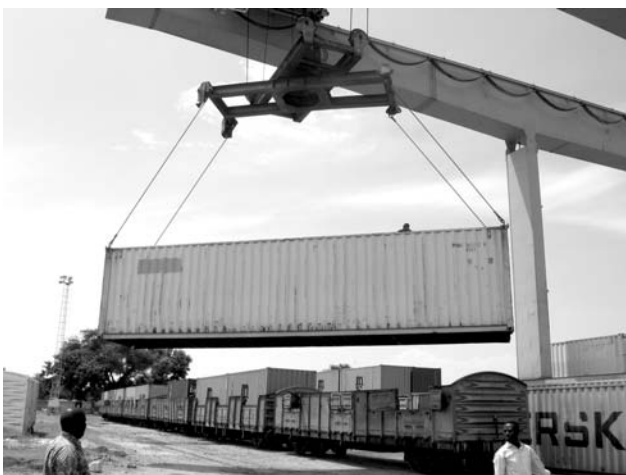
Our two containers arrived just after Christmas. Everything arrived in excellent condition. Thanks to all who gave so God's work can go forward.