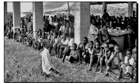
The Feeding Center

Our staff has been tending to the feeding center and meeting critical needs of poor people.