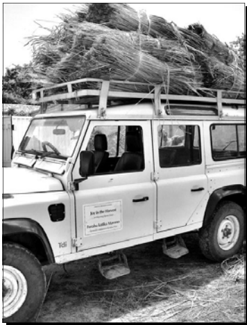
Grass for thatching poor people's huts being loaded on our Land Rover.