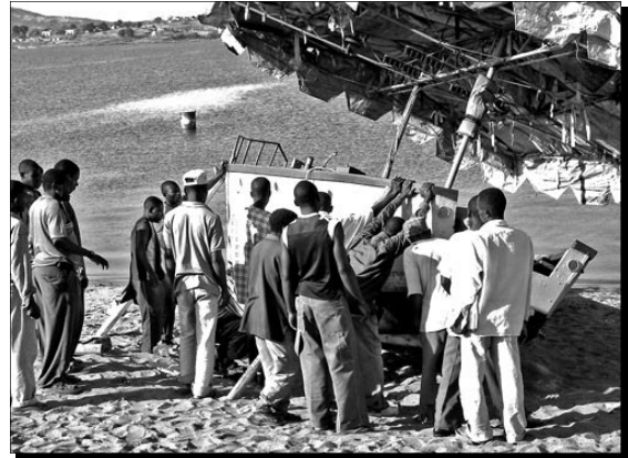
Our boat developed bad leakage. It was beached and then turned from side to side to re-plank and re-calk the bottom.