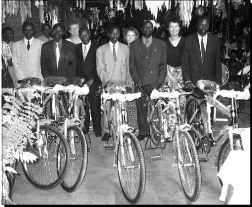
The Burundi Refugee Camp is so vast our United Methodist pastors had a transportation problem. Six bicycles were donated to help them get around.