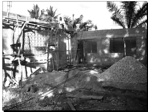
The "First" United Methodist Church of Dar es Salaam when under construction.