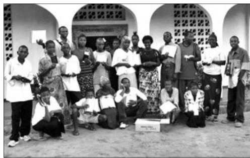
Tanzania young people "earn" a Bible by completing a study of the book of Proverbs.

A. We purchase Swahili Bibles in quantity to get the best prices. Our price for a small Bible is $3.50, large Bible without concordance $4.25, and large Bible with concordance $5.25 Funds can be sent via the USA address and please designate the gift "for Bibles".