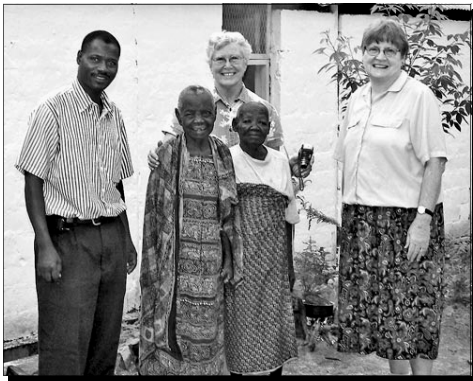
The Kigoma Destitute Camp received a facelift. All buildings were cleaned, repaired, and painted. New foam mattresses were provided for the residents.