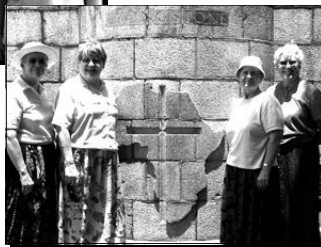
Seven ladies who made a difference!

bicycles for refugee pastors. They also worked with the Kigoma UM youth group and gave them sewing machines. The Illinois/Iowa group supervised the renovation of the destitute camp, did sewing projects, and helped with computer work. Many thanks to these wonderful ladies. ☩