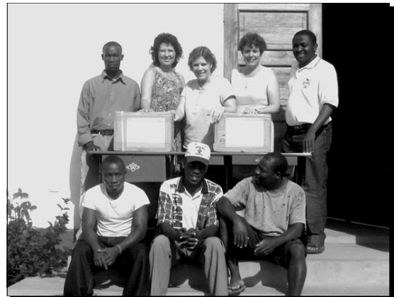
Sewing machines were donated to the youth group. Training classes have begun to teach the girls how to make primary school uniforms so children can go to school.