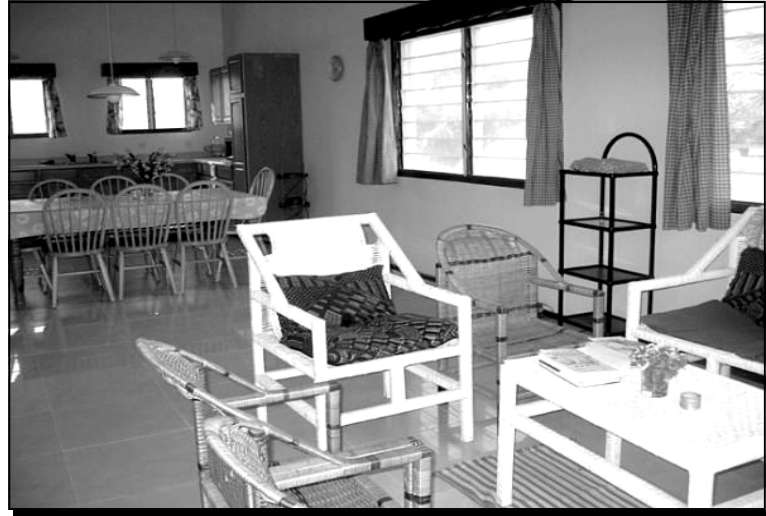
Sitting area, dining area, and kitchen of the Kitley House.

We are thankful for these facilities which will enable us to comfortably accommodate future guests. Come to Kigoma and use them! ☩