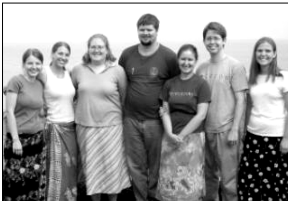
Our Interns for 2005.