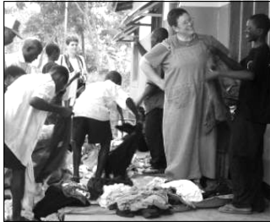
Zionsville, IN Team donated used clothes for hundreds of orphans.