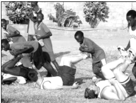
Sports Program creates an opportunity to talk about AIDS.