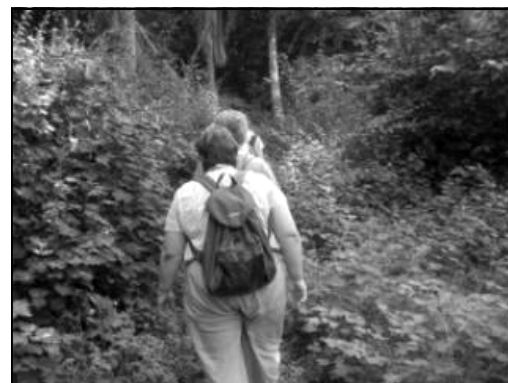
From Zionsville to the African jungle to see Jane Goodall's wild chimpanzees.