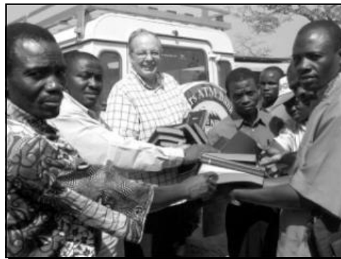
Distributing Bibles to Congolese church leaders in the Lugufu Refugee Camp in Tanzania

A. There is no doubt that Africa is a troubled continent. In the last fifty years, 36 of Africa's 52 nations have experienced war and armed conflict. In the last five years, 3.8 million have died due to war in Congo. Tanzania shares borders with Congo and Burundi. These nations are presently fighting civil wars.