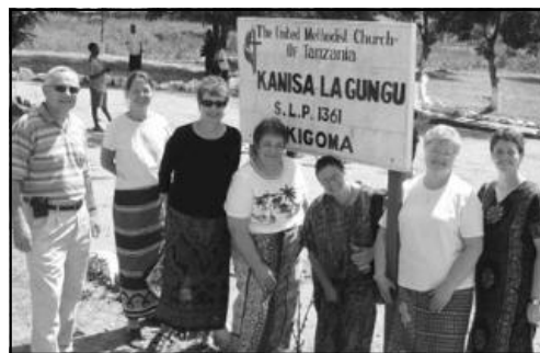
Zionsville, Indiana team at the Gungu United Methodist Church in Kigoma, Tanzania.

The team of seven from Indiana quickly became like family to us. They also endeared themselves to the Tanzanians. From visiting the destitute camp, to working at the