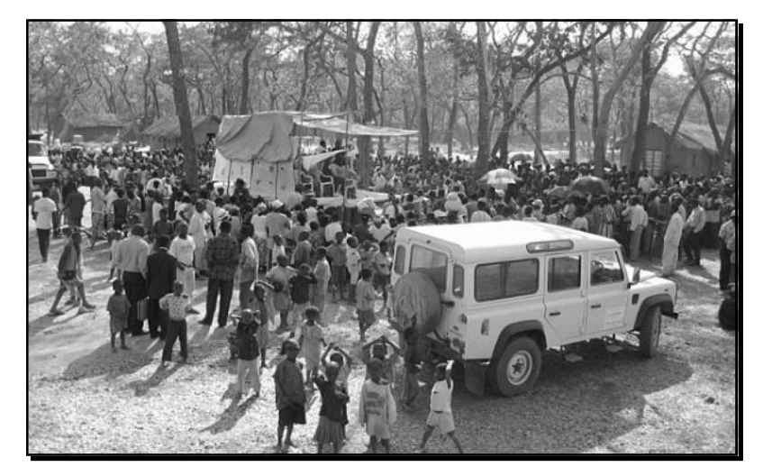
Twenty refugee pastors attended the services to support this effort to reach people for Christ.

On the last day of the services many adults responded to an invitation to accept Christ as their Lord and Savior. It was wonderful to see many children come to accept the Lord during a special invitation for them. \mathcal{H}