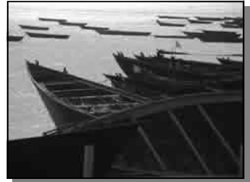
Fishing and cargo boats are a significant part of Kigoma's culture.