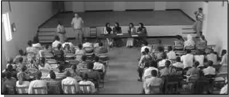
Lowell speaking at the graduation service for computer students.