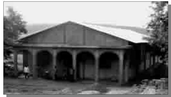
The new church in Gungu has its roof and cement floor. Just a few finishing touches remain to be done.