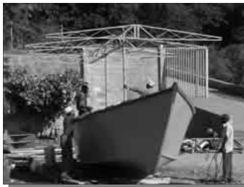
New boat is nearing completion