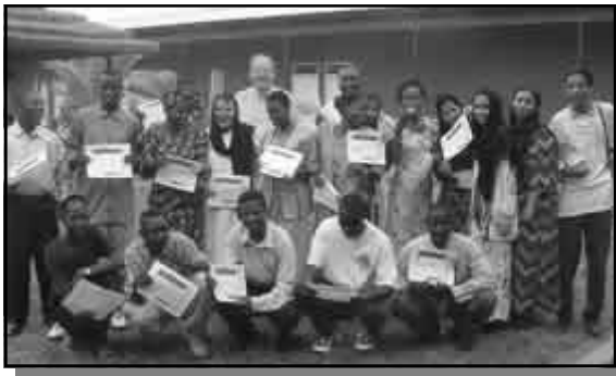
Our graduates with their certificates of achievement and smiles.