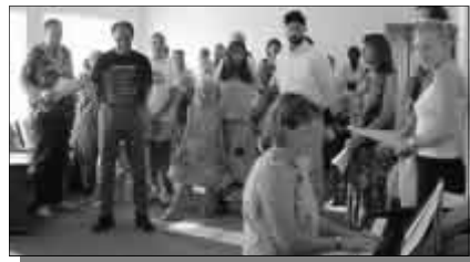
The Dedication Service to Tanzania.

Completion of the building was time consuming, hard work but the end result is beautiful.