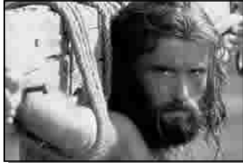
The crucifixion of Christ as depicted in the Jesus movie.

By train, Landrover, and bicycles, the three man evangelism team has taken the Jesus movie to 13 locations in the past 4 months. 248 hours of video and cinema were shown. Attendance at the showings was over 60,000 with 2,407 decisions made. Remote villages required the use of 5 volunteer bicyclists to transport the equipment to them. Invitations continue to arrive from many places asking for the team to come.