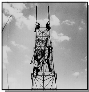
The Tower Going Up

to finish the job. The first section is 20 feet tall and each of the remaining sections are 10 feet. It is estimated that each 10 foot section weighs between