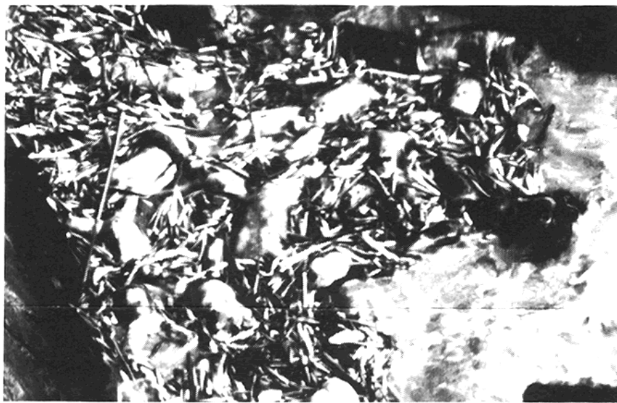
Every day, thousands of bodies float down the Kagera River.

Officials permitted Wertz to go out onto the bridge. There, he saw these "most terrible things." He saw numerous bodies floating down the river. (Officials estimate that upstream the Rwandan military is dumping 5,000