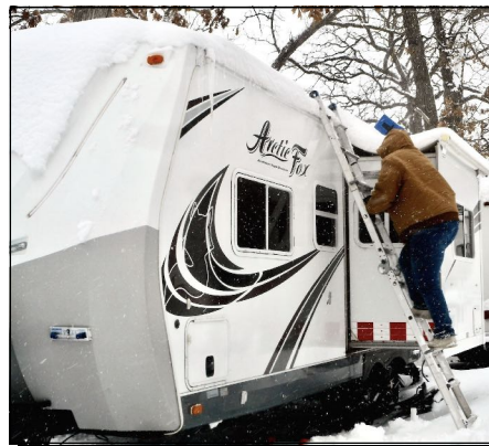
Furlough, winter 2020

Claudia will be in charge of our furlough speaking schedule. It is an almost impossible job but she always tries to accept all invitations. Right now, here is our plan when we come to the USA in July. First, we will take time to get our camping trailer ready to hit the road.